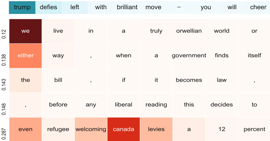
Fig. 2. Visualization of Attention Layers in a Fake News Article with Headline “Trump Defies Left with Brilliant Move - You Will Cheer”

We visualize the attention weights given to words, sentences and the headline for a sample article through a heatmap in Fig. 2. The sentences with the top five attention weights and the first eight words in each sentence are shown for clarity. Word attention weights \alpha_w are normalized using sentence attention weights \alpha_s by \alpha_w = \sqrt{\alpha_s}\alpha_w . Sentence attention weights are shown on the extreme left edge. We observe that sentence 5 and has been assigned the highest weight (0.287). Interestingly, sentence 5 which states “Even refugee welcoming Canada levies a 12 percent penalty on immigrant money” is a factually incorrect sentence.